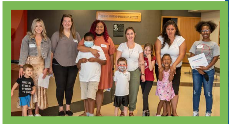
Student Recipients and children at the Fall 2021 Awards Ceremony

"...as a single mother I try to set the best example that I can for them."