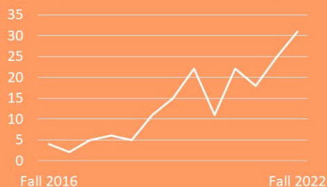
Number of Scholarships per Semester

*Estimate is derived from application materials and a post-scholarship survey first administered to scholarship recipients in 2022. Due to small population and sample size, this value will fluctuate from year to year.