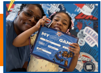
OSPSP families attended the Thunder vs. Timberwolves game in March. Thank you OKC Thunder for the donated seats!!